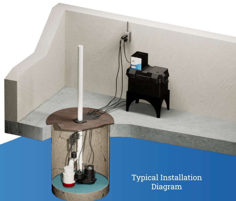
Typical Installation Diagram